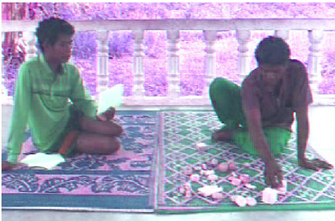
Figure 2. The Jahai ‘ShaClaTa’ set-up, with a ‘director’ with photographic stimuli to the left, and a ‘matcher’ with the set of wooden objects to the right.

An interesting fact about the Jahai data is that the task failed to spur use of classifiers. Instead, a range of other linguistic strategies were used by the director and matcher in solving the task. For example, objects were identified by means of metaphorical nouns and shape-encoding property verbs. Another frequently used strategy of reference was demonstratives, and all of the eight distinctions of the Jahai demonstrative system were employed. For example, they were used by the director when guiding the matcher to the correct item in the pile of wooden objects, which was visible to both participants. This strategy was particularly popular at the beginning of the sessions, before the participants had become familiar with the objects and given them more specific names. The particular setting thus produced rich data on exophoric demonstrative reference to real, visible objects in ‘table-top’ space.