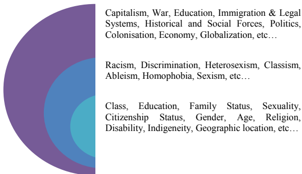
Figure 1. Intersectionality Lens. Adapted from the Canadian Research Institute for the Advancement of Women (2009, p. 5).

Using intersectionality as my lens, I have a new perspective on my research and advocacy work for and with plurilingual teachers at OISE. I have considered other theoretical and conceptual lenses but the dynamics I have seen at play are best illustrated by a figure from a book entitled “Intersectionality 101”. This framework has helped me to understand language, culture and immigration status as just three aspects of the complex identity of my diverse OISE students. Intersectionality also highlights how problematic it is to reduce any person’s identity to a few characteristics that we believe best define them.