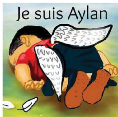
Figure 1. Visual rescripting of the viral image [Post No 532] 7:13am – 3 Sep 2015 “Je suis Aylan. #JeSuisAylan #Syria #SyriaCrisis #Refugees”

As De Cock and Pizzaro Pedraza (2018, 214) have shown in their corpus-based study of the broadening of meaning in the case of the hashtag #JeSuisCharlie, such uses attest to the gradual evolution of the phrase ‘JeSuis’ into an independent element which becomes emblematic of Twitter users participating to public displays of mourning and solidarity via the use of hashtags.