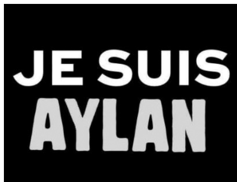
Figure 2. The meme slogan ‘Je Suis Aylan’ [Post No 469] 1:49pm – 3 Sep 2015 “#JeSuisAylan”

Other images pertaining to the Storyrealm include slogan memes, which are reworkings of the popular ‘Je Suis Charlie’ meme, as shown in Figure 2.