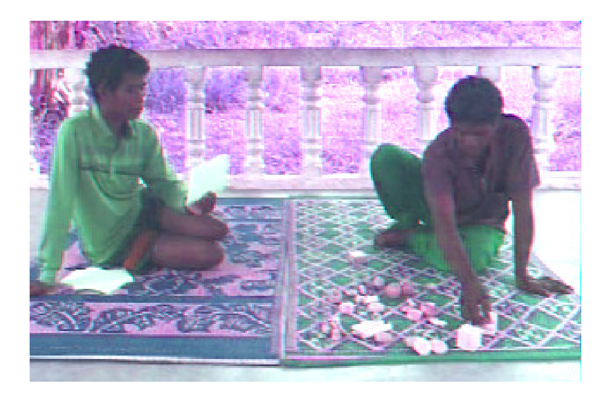
Figure 2. The Jahai 'ShaClaTa' set-up, with a 'director' with photographic stimuli to the left, and a 'matcher' with the set of wooden objects to the right.

An interesting fact about the Jahai data is that the task failed to spur use of classifiers. Instead, a range of other linguistic strategies were used by the director and matcher in solving the task. For example, objects were identified by means of metaphorical nouns and shape-encoding property verbs. Another frequently used strategy of reference was demonstratives, and all of the eight distinctions of the Jahai demonstrative system were employed. For example, they were used by the director when guiding the matcher to the correct item in the pile of wooden objects, which was visible to both participants. This strategy was particularly popular at the beginning of the sessions, before the participants had become familiar with the objects and given them more specific names. The particular setting thus produced rich data on exophoric demonstrative reference to real, visible objects in 'table-top' space.