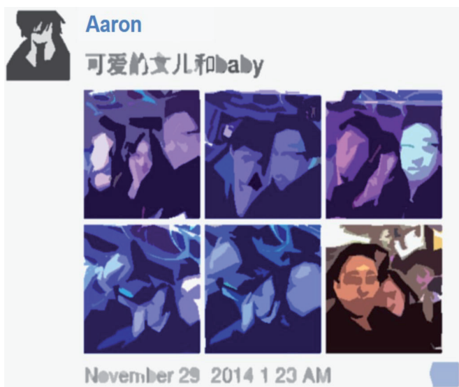
Figure 3. Hanging out with the Pittsburgh gang

Figure 3, which is from Aaron's WeChat account, exemplifies how the bonds described in Extract 6 were instantiated through regular meetings that took place during school breaks.