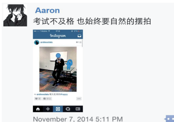
Figure 7. Keep on posing

Translation: Even if I failed my tests, I would still pose naturally for photos as always