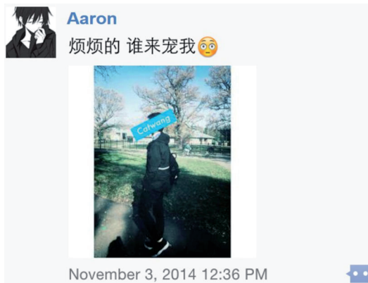
Figure 6. Who'll come to love me?