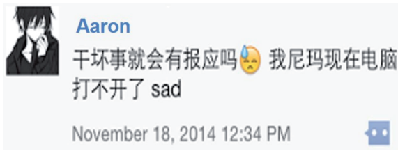
Figure 5. Sweating and sad

his use of translanguaging and emoticons – were able to communicate his sadness with amazing specificity and economy.