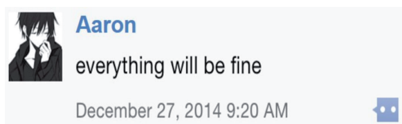
Figure 8. Everything will be fine

Translation: Even if I failed my tests, I would still pose naturally for photos as always