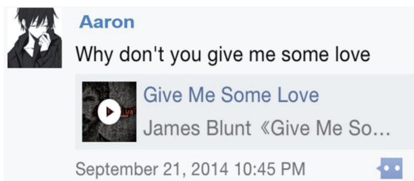
Figure 4. Give me some love

Underscoring the agency of digital natives but emphasizing the affective dimensions of online communication, Ortner (2015: 318) notes: