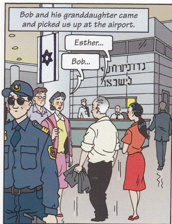
Fig. 3 An airport in Israel (in The Search , p.31)

Yet simultaneously, students are addressed – and constituted – in the accompanying materials within a frame of human rights. The materials provide precisely the link to question the white, heterosexual matrix. Particularly in Germany, where the Holocaust was traditionally taught as part of students' own heritage of being implicated in the annihilation ( Vergangenheitsbewältigung ), but which now has a large proportion of ethnic minority students who cannot be engaged in this way (see Task Force for International Cooperation on Holocaust Education, n.d.), stressing the contingency of this link can shift the terrain on which the Holocaust is taught and what it means to young people from diverse backgrounds. Holocaust education then becomes neither a straightforward teaching of specific historical knowledge, nor a moral code imposing American values, but a means by which young people with a minority background (whether through immigration, 'ethnicity', sexual orientation or other social relations and practices) can claim their particular right to a better life in terms of universal rights (see Laclau 1996).