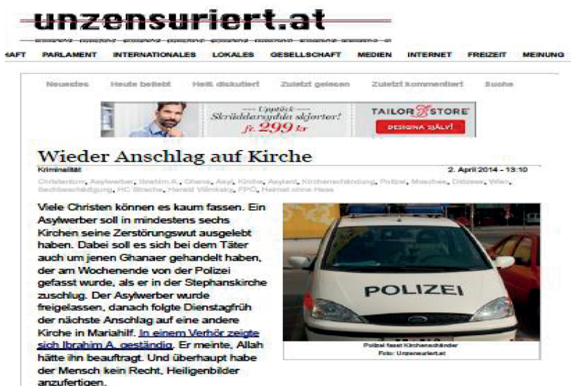
Figure 2. Unzensuriert.at Post of 02/04/2014 4

As soon as one begins the reading of the main text of the item, it also becomes clear that the uncivil frame is the one that is, in fact, dominating throughout. We learn first about an 'asylum seeker' ( Asylwerber ) who later on, in the course of nominalisation chains, is further specified as 'Ghanian' ( Ghanaer ) and eventually proper-named as 'Ibrahim A'. We are then are provided with explanation of his alleged actions: 'He claimed that Allah gave him the task' ( Er meinte, Allah hätte ihn beauftragt ) with thus the introduction of the (here still only implied) Islam-related motives for the violence.