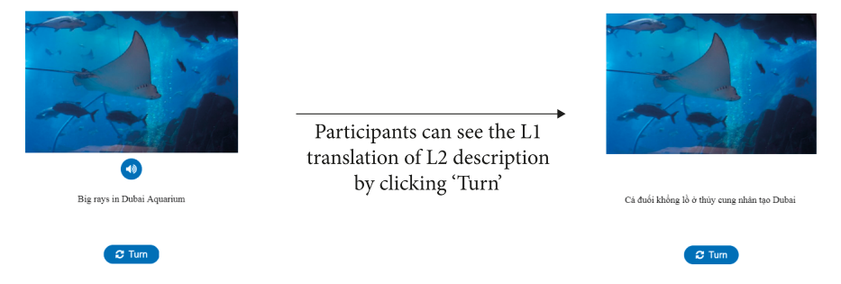
Figure 2. The web-based English-Vietnamese picture glossary (created by H<sub>5</sub>P Flashcard tool)

describe your (imaginary) travel experience in English using Instagram photos as prompts, and (2) orally present in English a travel itinerary to foreign tourists based on Vietnamse tourist leaflets in which tourist information was presented in bulleted lists. We used picture prompts (i.e. Instagram photos) and L1 bulleted lists (in the leaftlets) to elicit the use of target items. In addition, a web-based English-Vietnamese picture glossary was created to faciliate the learners' output production, as previous research has shown that students need to have some receptive knowledge of language forms before engaging in any output activities (Swain & Lapkin, 2007). However, the learners were not compelled to use the glossary. With such a design, the focus of these tasks is predominantly on output production, not input comprehension like in the input-based tasks. The glossary contained pictures and L2 descriptions related to the target items in the written and spoken mode (i.e. learners could see the descriptions and click on the loud speaker symbol to hear the spoken form) (see Figure 2).