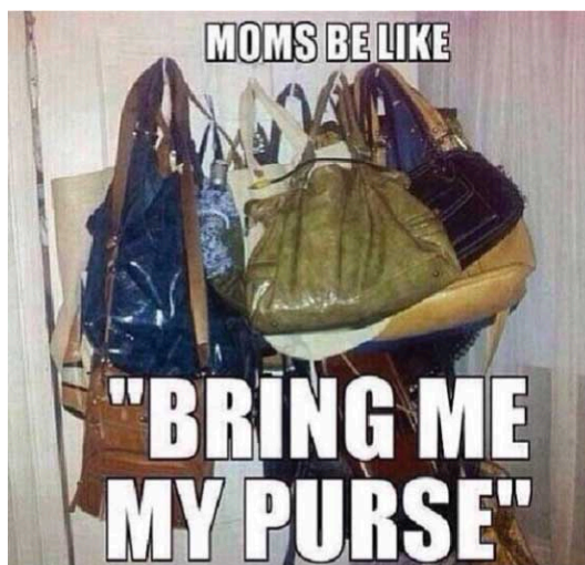
Figure 5. An example of the “be like” meme with mom s as subject NP