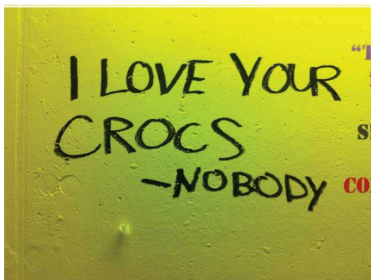
Figure 3. A condensed form of “said no one ever” appearing in a piece of graffiti in Toronto (Ralph 2012)

a stupid answer or Ask a stupid question, get a stupid answer use enough recognizable, meaningful substructures (in terms of structural parallelism, clausal and verbal forms, and the like) to successfully call up the same conditional meaning which a full conditional construction like If you ask a stupid question, then you get a stupid answer does. In similar vein, the reduced form in Figure 3 is sufficient to call up the same type of meaning as in the fuller examples in Figures 1–2: a viewpoint apparently quoted from another source is pithily revealed to only have been a staged viewpoint, attributable to no one (in their right mind), and the incongruity of an apparent quote with ultimately no possible speaker for it is resolved as expressing a stance of rejection and ridicule towards the staged viewpoint.