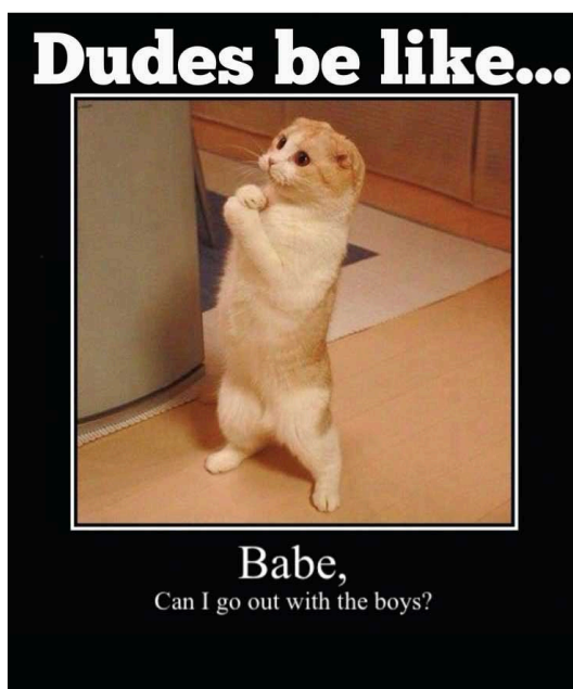
Figure 6. An example of the “be like” meme with dudes as subject NP

Turning to a different family of Internet memes, consider Figure 7, which typifies inconsiderate, unreliable behaviour by structuring it in terms of a fictive conversation, expressed across text and image with minimal formal means.