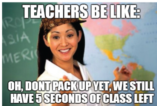
Figure 8. A memetic blend in which the “be like” meme meets the “scumbag hat”

As a final illustration, demonstrating emerging constructional features of image-text combinations in Internet memes, consider Figure 8. This is a “be like” meme stereotyping teachers’ behaviour, blended with a selected element from the Scumbag Steve meme, viz. the so-called scumbag hat. The hat has taken on a life of its own and can be added onto anyone or indeed anything to turn the person or thing into a ‘bad guy/thing’. A previously unanalysed part of the image has thus become a meaningful (sub-)construction on its own, sufficient to metonymically call up the fuller ‘bad guy’ meaning. It is perhaps not too far-fetched to suggest an analogy to splinter morphemes (Bauer, Lieber and Plag 2013, 525–530) like (a/o)holic or t(a/e)rian : these were originally non-morphemic parts of the words alcoholic and vegetarian respectively, and are now used productively as meaningful morphemes in new formations ( shopaholic , chocoholic , flexitarian , pescetarian , etc.).