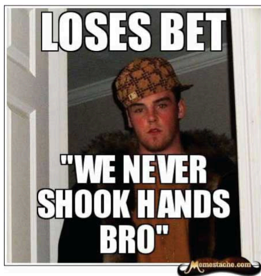
Figure 7. An example of the Scumbag Steve meme with quotation in the bottom text