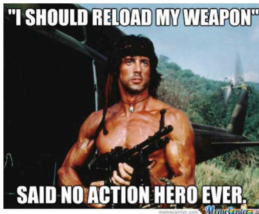
Figure 2. An example of the “said no X ever” meme

soon as readers/viewers get to the bottom text of the meme, the apparent perspective shift to some actual discourse source is quite expressly cancelled, and the point of the meme as a whole is revealed to be to expose an opinion, habit or attitude as too ridiculous or in some other sense flawed for anyone ever to contemplate it seriously. Thus, Figure 1 suggests no one in their right mind could ever think face tattoos are a good idea, and Figure 2 exposes the fakery involved in action heroes never running out of ammunition for what it is. The meme format turns out to