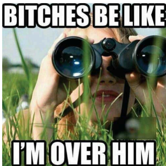
Figure 4. An example of the “bitches be like” meme

The examples in Figures 4–6 clearly demonstrate the importance of the image, which is generally greater than in the “said no one ever meme”, many examples of which still work as purely textually expressed stereotypes (compare Figure 3 above), and which has indeed been used purely textually in journalistic contexts (Dancygier and Vandelanotte 2017b, 573; for discussion of the degree of reliance on images in memes, see also Zenner and Geeraerts 2018). What makes these examples work as jocular comments on typical behaviour is a kind of incongruity introduced by the image: in Figure 4, the contrast between the fictively expressed statement “I’m over him” and the image showing the ex-girlfriend presumably following her ex’s every move through binoculars; in Figure 5, the complication, shown visually, that there is no one “purse” but masses of them to choose from; and in Figure 6, the contrast between the ‘toughness’ connotations of dudes and the submissive facial features of the cat, meant to be mapped onto the faces of dudes in a kind of multimodal simile (Lou 2017).