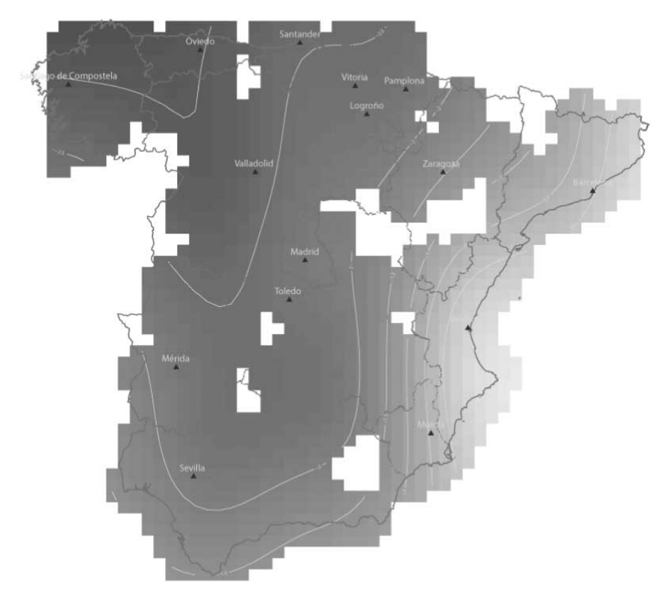
Figure 3. Predictions of a generalized additive model about the geographic distribution of haber pluralization in Peninsular Spanish: Twitter

lar data add further support to the hypothesis that haber pluralization is constrained by domain-general cognitive constraints on spreading activation. Also, I have examined whether haber pluralization may be spreading geographically in apparent time and whether or not its frequency increments over time in particular regions.