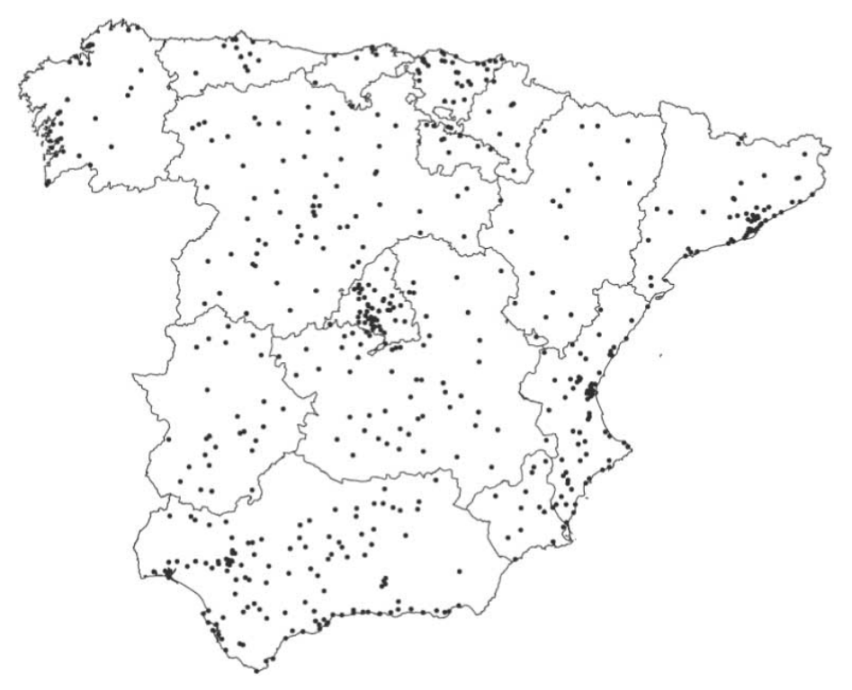
Figure 1. Localities included in the present study

When it comes to the overall distribution of singular and pluralized haber , the top row of Table 3 shows that, even though haber pluralization occurs across the entire Spanish peninsula, it is far less common in Peninsular than in Latin American Spanish, where pluralized haber typically represents some 40–80% of the cases, depending on the variety, the number of tokens, and the sociolect that are considered (e.g., Claes, 2016: Chapter 2; D'Aquino-Ruiz 2008; Bentivoglio and Sedano 2011; Lastra and Martín-Butragueño 2016). As a matter of fact, the fre-